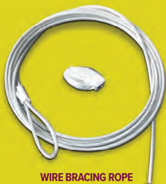
WIRE BRACING ROPE AND GRIPPLE®