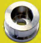
POST END PROTECTOR Optional extra