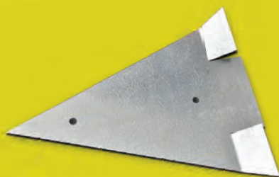
ANTI LIFT/TWIST PLATE